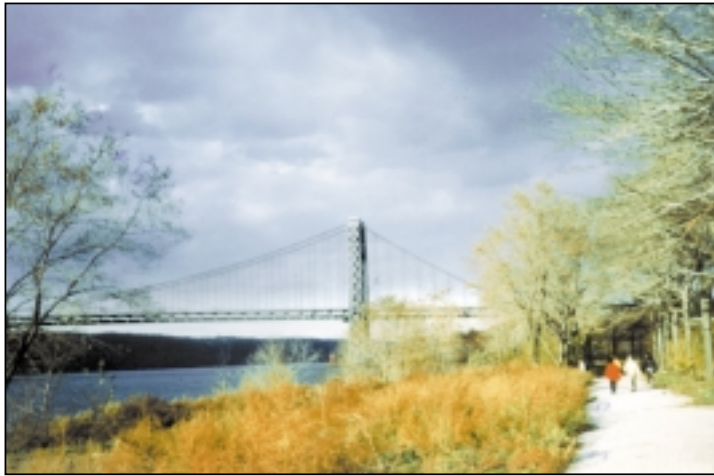
P10 View of George Washington Bridge looking north from the Manhattan section of the BTB Trail.

40 Bear Mountain Bridge. Connects Anthony's nose to the Bear Mountain area. Breathtaking views of the winding river gorge and the Hudson Highlands.