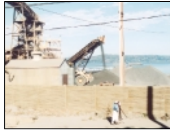
32 Tilcon Works, Haverstraw

Majestic panoramas of the Hudson River and home of Iona Island Nature Preserve in Bear Mountain State Park. Hiking and bird watching area.