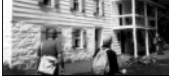
23 Blackledge-Kearney house (General Cornwallis' headquarters)